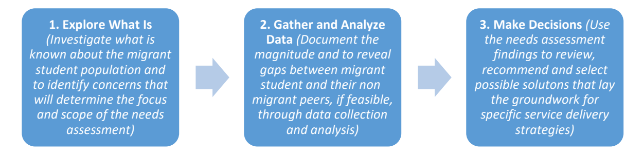
Figure 6.16. Phases of the PA-MEP Comprehensive Needs Assessment

The Service Delivery Plan outlines performance goals to be met at the end of a five-year period, and guides the delivery of services in the following focus areas: reading, school readiness, mathematics, high school graduation, parent/family involvement, out-of-school youth, dropouts, and health. The most recent CNA was completed in 2013. The PA-MEP is currently in the final stages of developing its updated, revised Service Delivery Plan, which is expected to be complete by fall 2017.